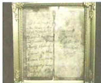
Flyleaf from the first Minute Book of Greenock Burns Club.

The Object of the Club is to cherish the name of Robert Burns, to foster a love of his writings and generally to encourage an interest in the Scottish Language and Literature.