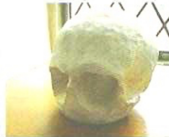
Cast of Robert Burns skull.