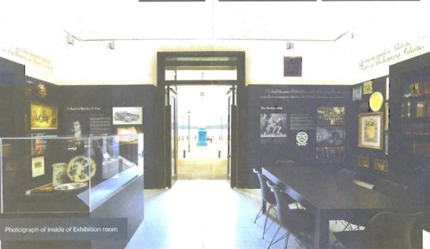
Photograph of inside of Exhibition room

Greenock Burns Club own the Monument and the title deeds to her grave.